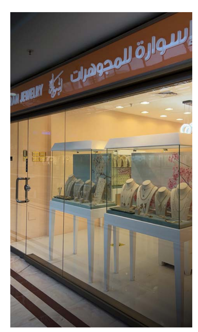
ESWARAH LAILA GALLERY - KUWAIT