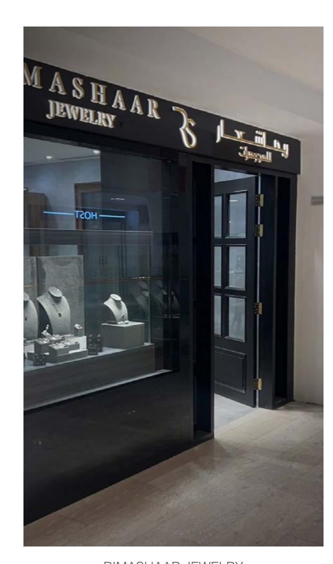
RIMASHAAR JEWELRY SALHIYA COMPLEX - KUWAIT