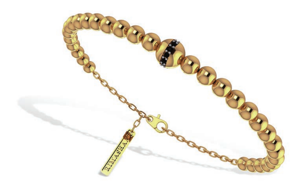
GOLD & DIAMOND