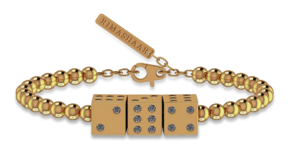
GOLD & DIAMOND