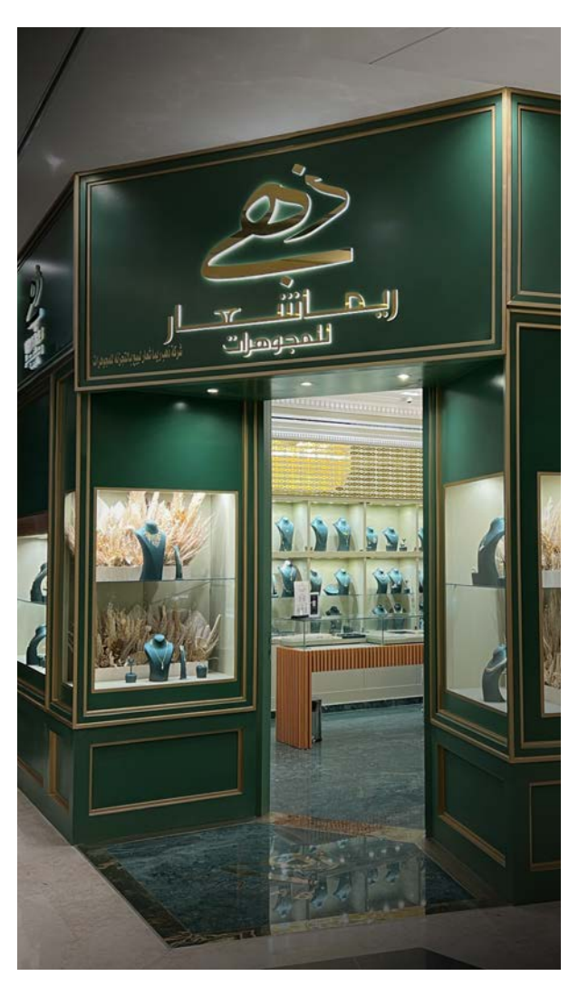
THAHAB RIMASHAAR ALHAMRA TOWER - KUWAIT