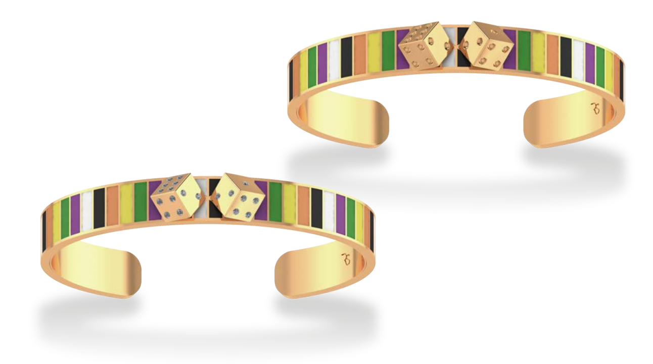
GOLD & DIAMOND